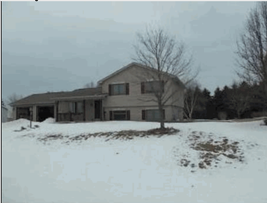
Total living area is 1,915 SF; building assessed value is $153,600