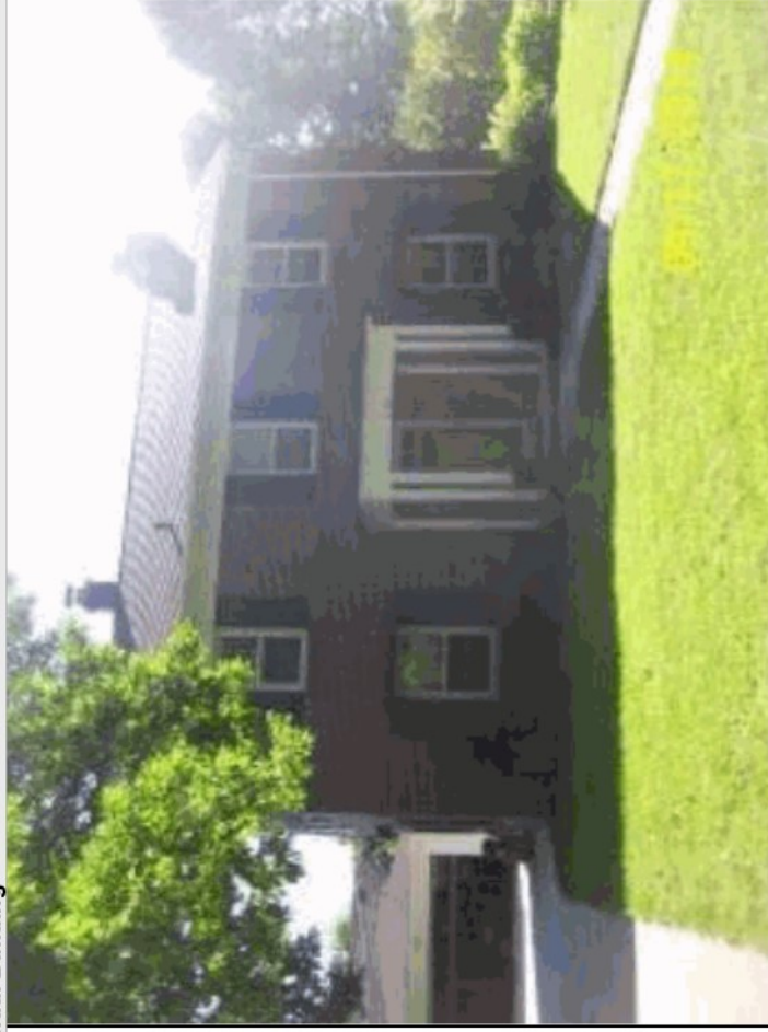
Total living area is 2,111 SF; building assessed value is $195,000