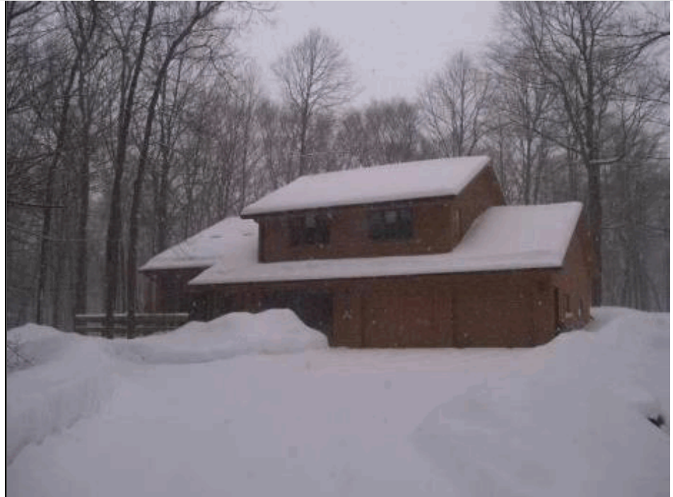
Total living area is 1,840 SF; building assessed value is $195,900