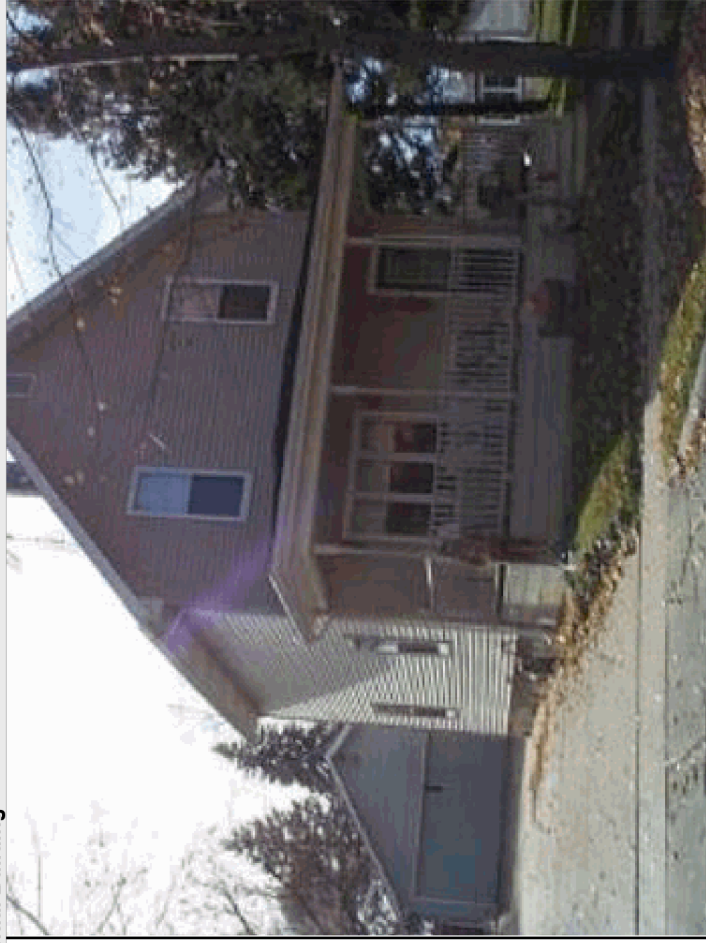
Total living area is 1,418 SF; building assessed value is $85,900