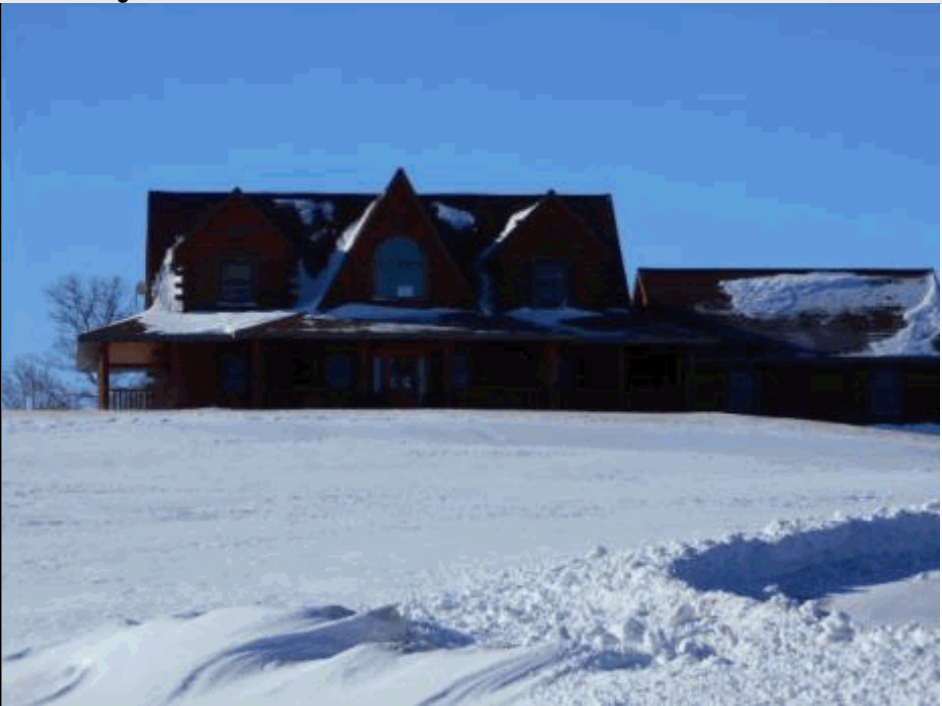
Total living area is 2,344 SF; building assessed value is $288,700