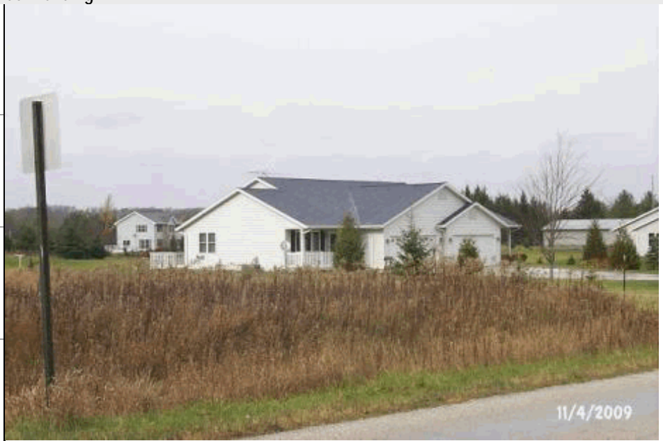
Total living area is 1,281 SF; building assessed value is $97,900