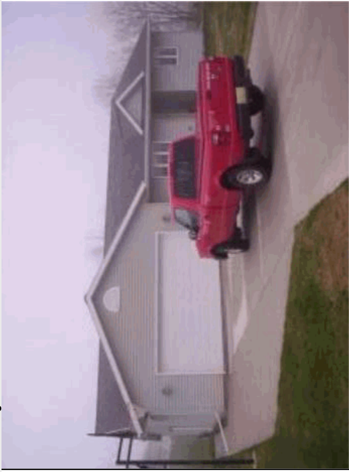
Total living area is 1,484 SF; building assessed value is $163,100