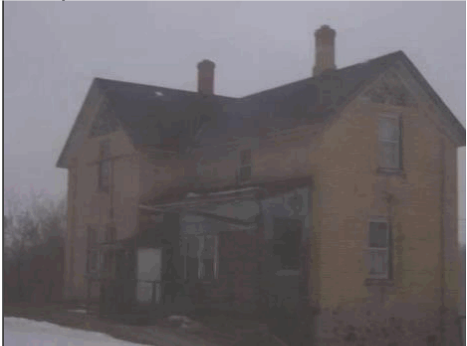
Total living area is 1,326 SF; building assessed value is $41,400