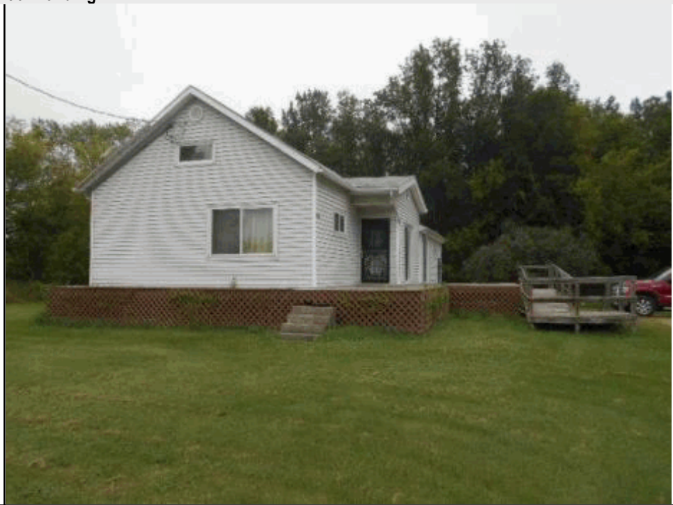
Total living area is 1,372 SF; building assessed value is $77,900