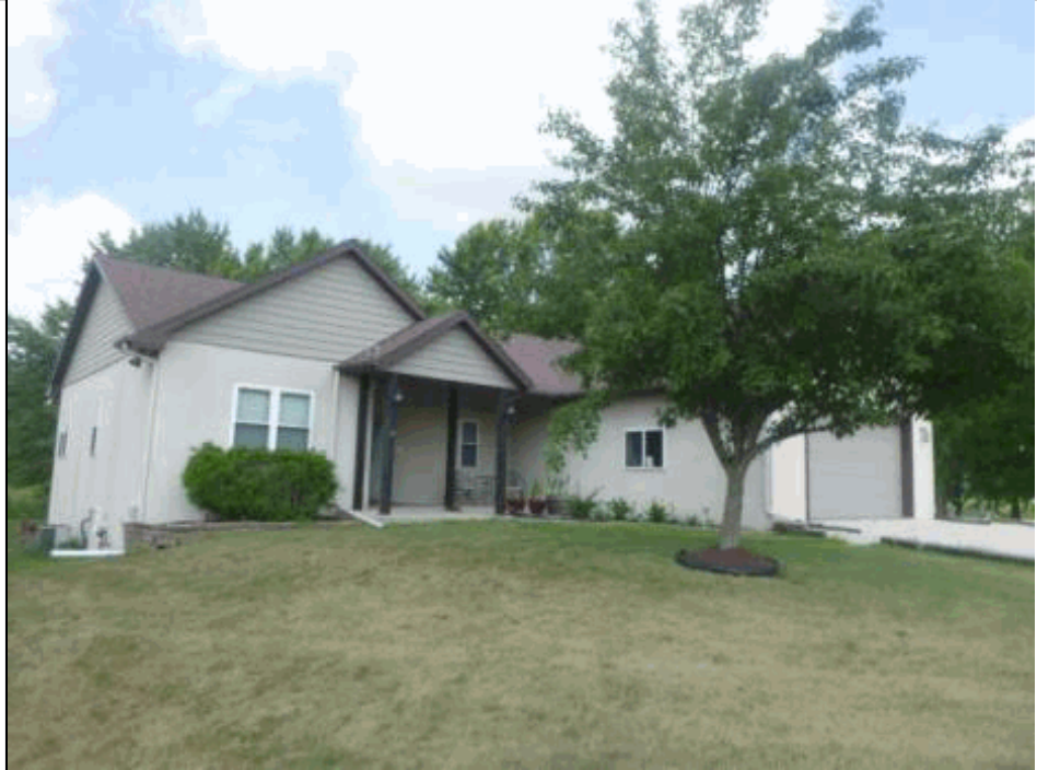
Total living area is 2,119 SF; building assessed value is $351,100