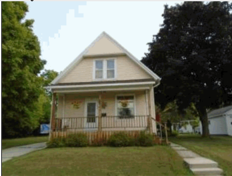
Total living area is 1,134 SF; building assessed value is $127,100