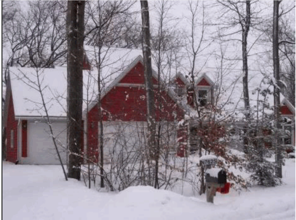
Total living area is 4,594 SF; building assessed value is $312,000