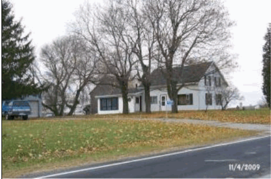
Total living area is 1,790 SF; building assessed value is $72,500