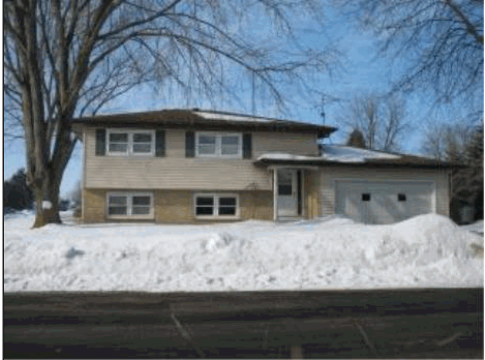
Total living area is 1,588 SF; building assessed value is $96,500