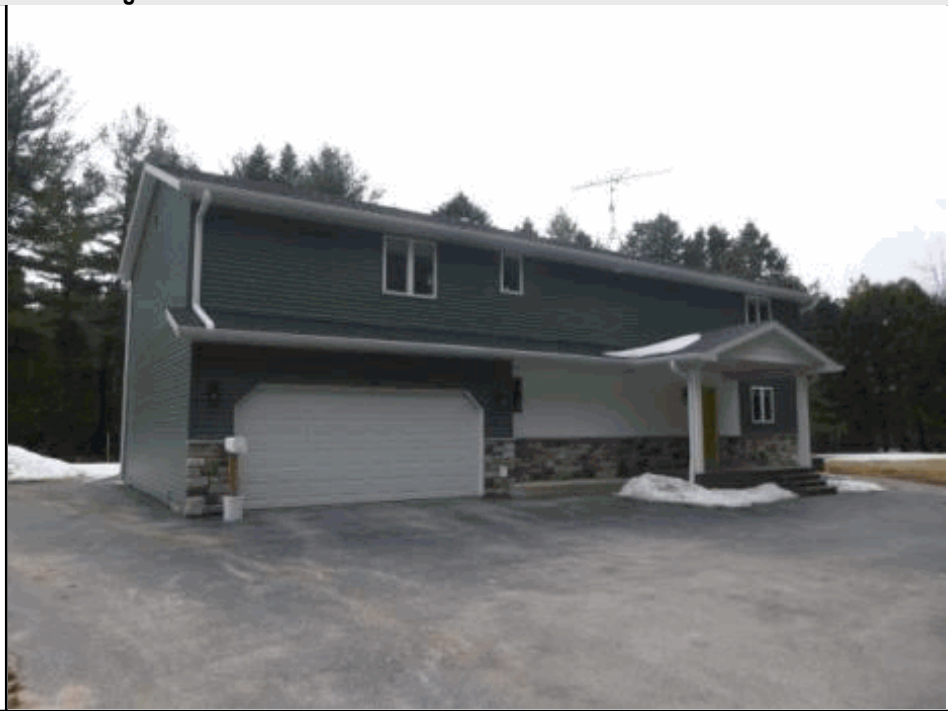
Total living area is 2,144 SF; building assessed value is $214,000