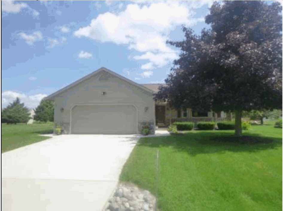
Total living area is 2,516 SF; building assessed value is $295,400