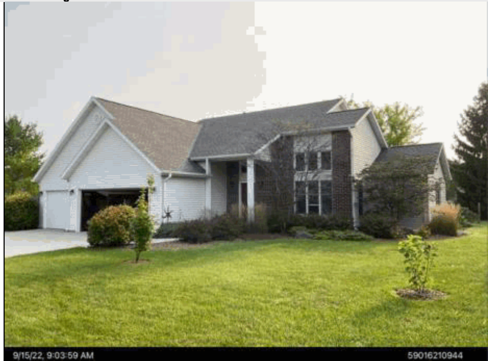
Total living area is 2,394 SF; building assessed value is $311,500