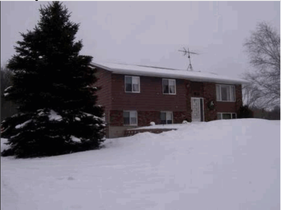
Total living area is 1,988 SF; building assessed value is $112,900