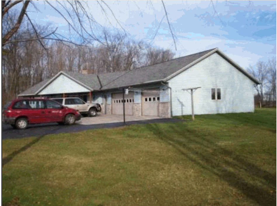
Total living area is 2,418 SF; building assessed value is $211,800