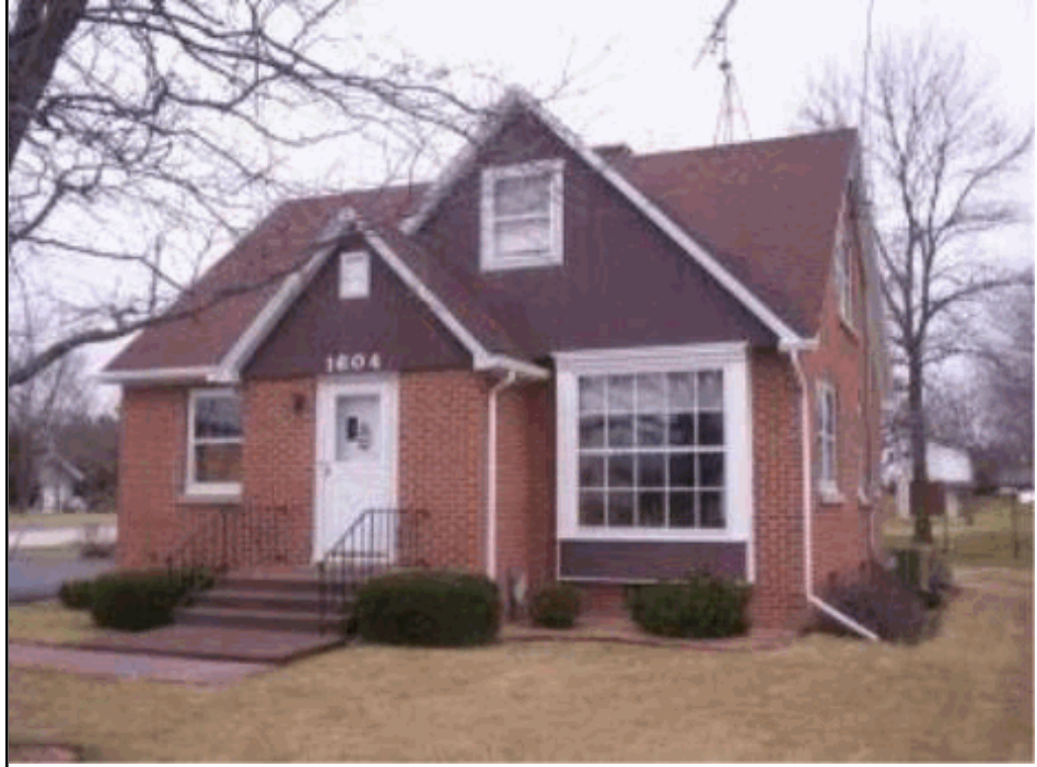
Total living area is 1,417 SF; building assessed value is $105,100