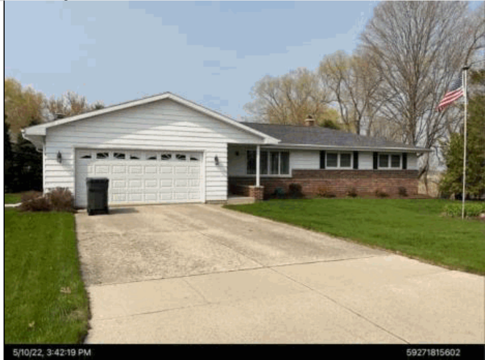
Total living area is 1,568 SF; building assessed value is $195,500