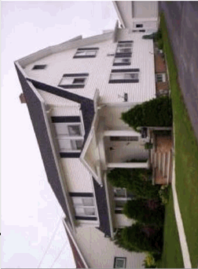
Total living area is 1,906 SF; building assessed value is $121,900