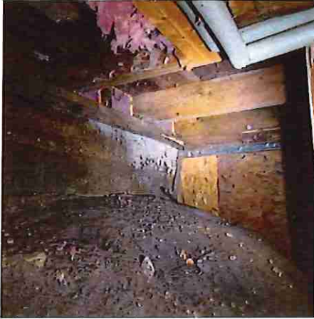
Dirt floor in crawlspace.

Recommend installing vapor barrier to adhere to best practice.