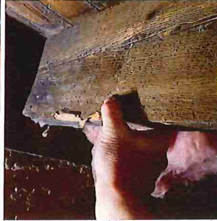
Floor joists and building components in crawlspace appear satisfactory at time of inspection.