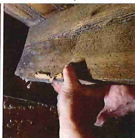
Floor joists are solid.