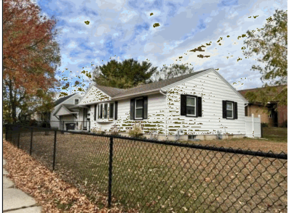
Total living area is 1,092 SF; building assessed value is $175,700