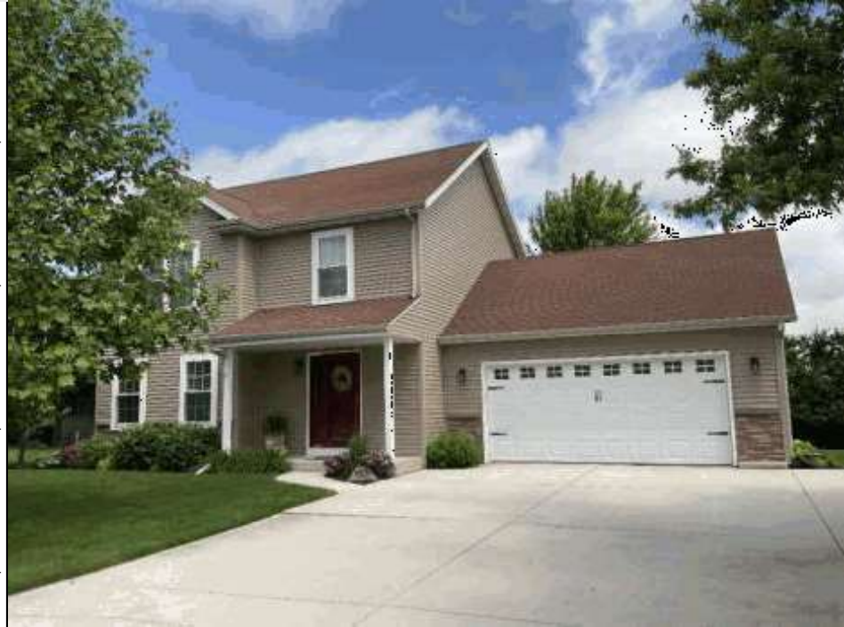
Total living area is 1,512 SF; building assessed value is $252,500