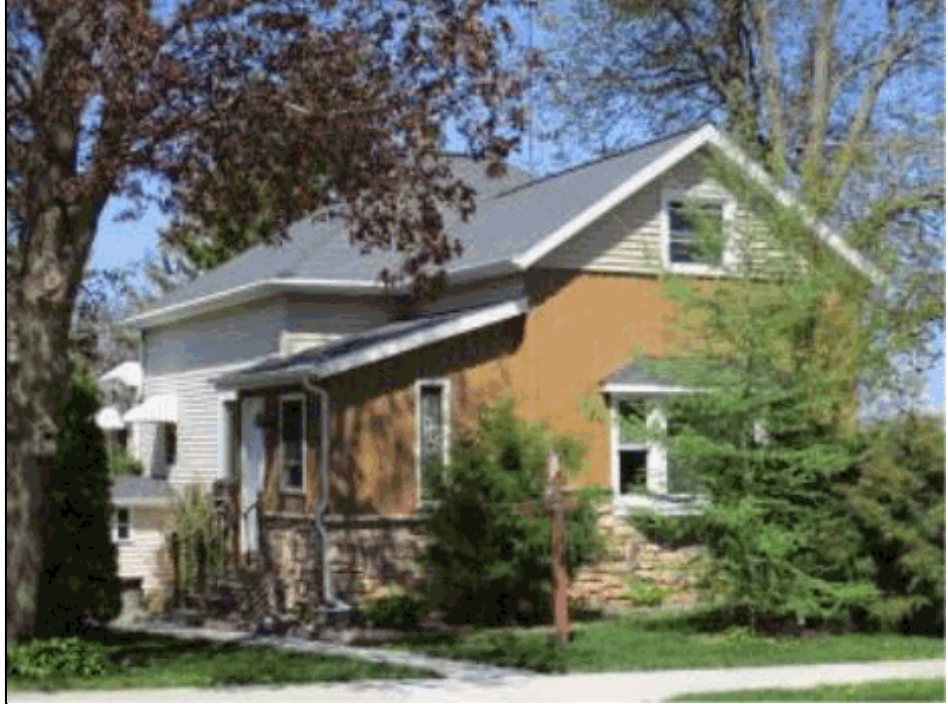
Total living area is 1,492 SF; building assessed value is $118,800