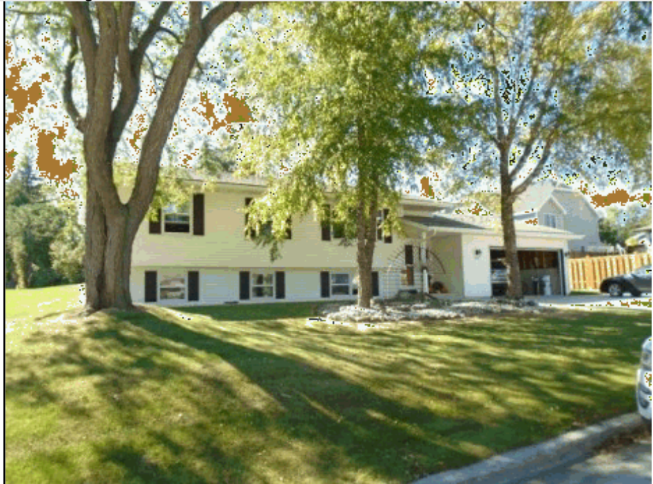
Total living area is 1,218 SF; building assessed value is $257,100