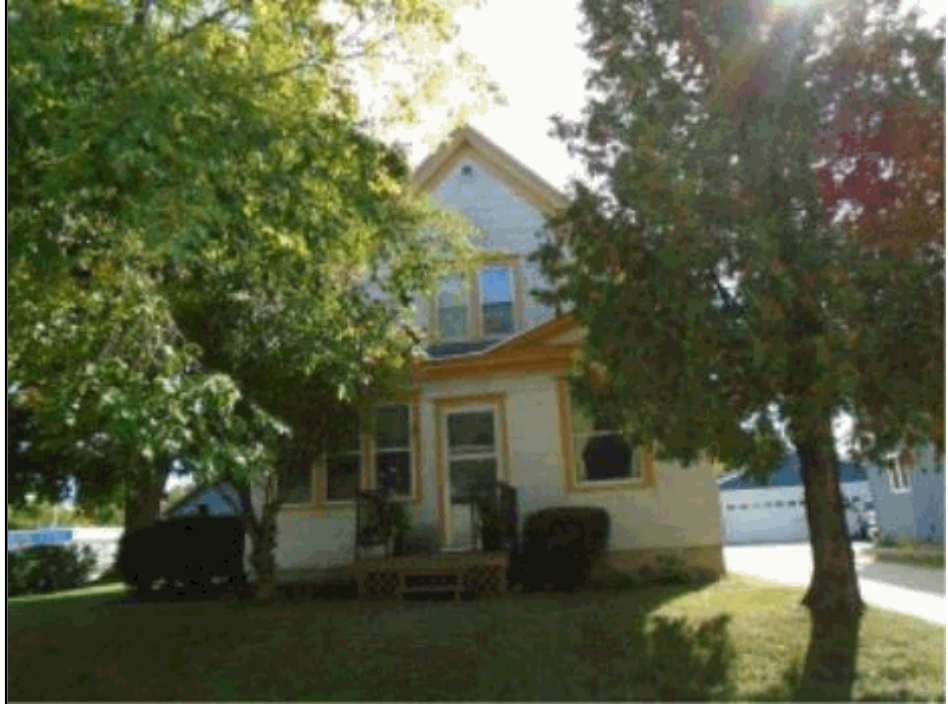
Total living area is 1,656 SF; building assessed value is $167,600