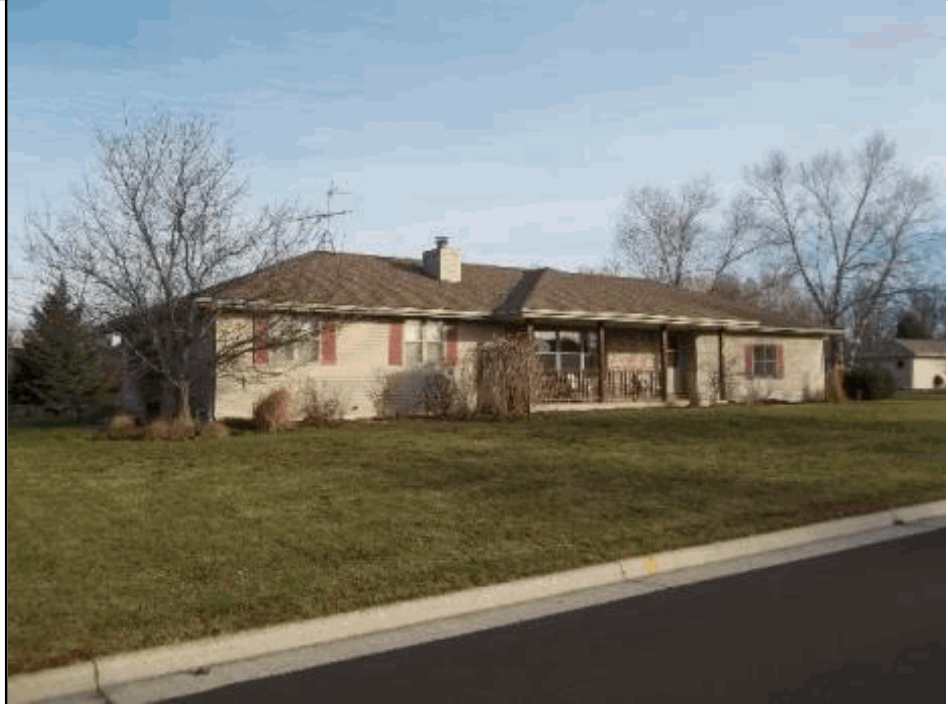
Total living area is 1,404 SF; building assessed value is $283,300