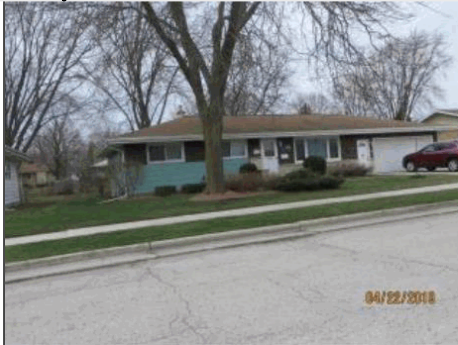
Total living area is 1,248 SF; building assessed value is $176,300