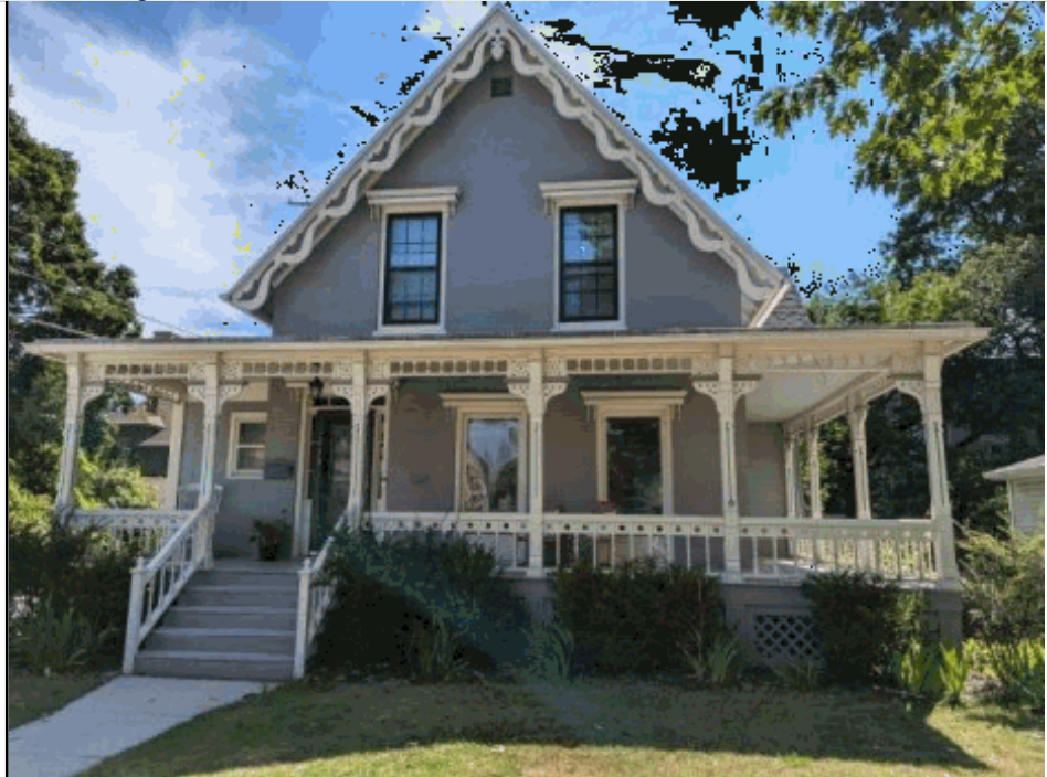
Total living area is 2,156 SF; building assessed value is $292,400