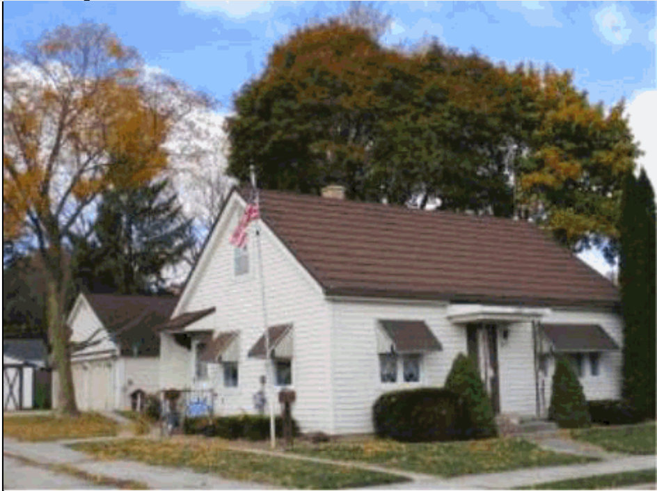
Total living area is 1,152 SF; building assessed value is $129,500