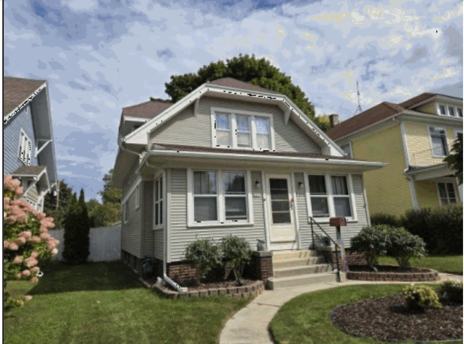
Total living area is 1,176 SF; building assessed value is $172,300