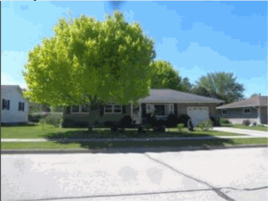
Total living area is 1,040 SF; building assessed value is $152,700