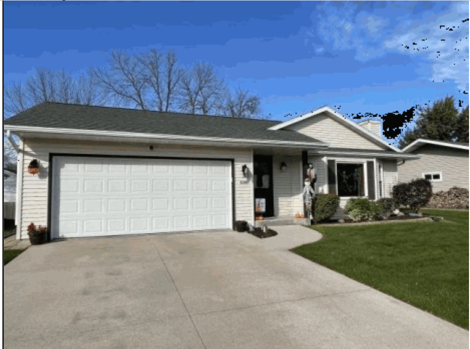
Total living area is 1,279 SF; building assessed value is $262,800