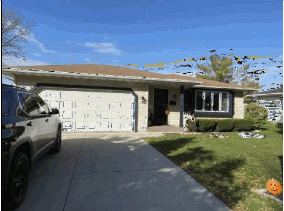
Total living area is 1,176 SF; building assessed value is $226,200