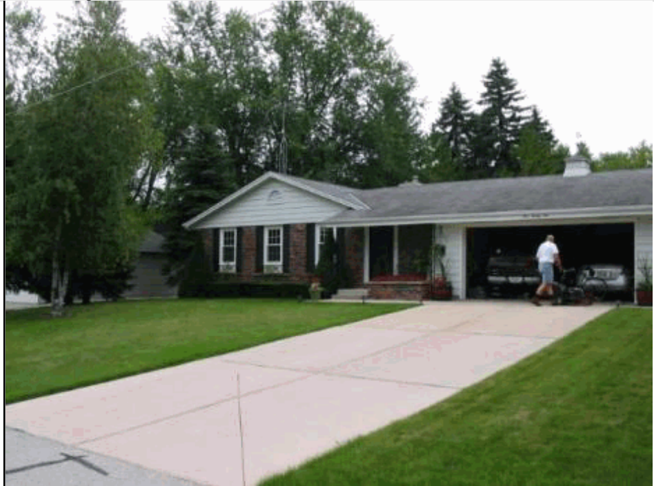
Total living area is 1,584 SF; building assessed value is $205,900