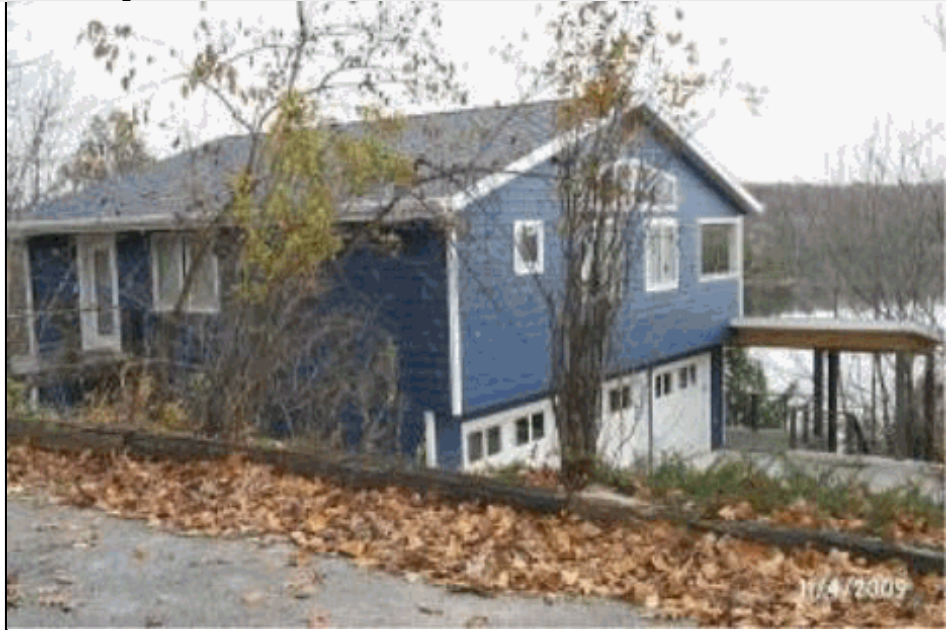
Total living area is 3,186 SF; building assessed value is $721,500