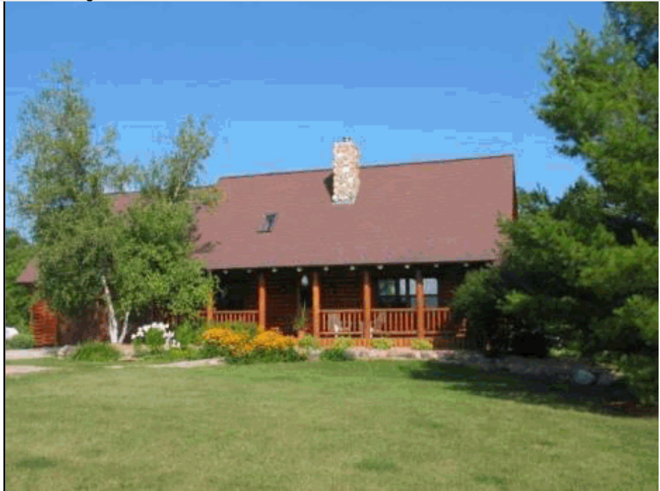
Total living area is 1,843 SF; building assessed value is $344,500