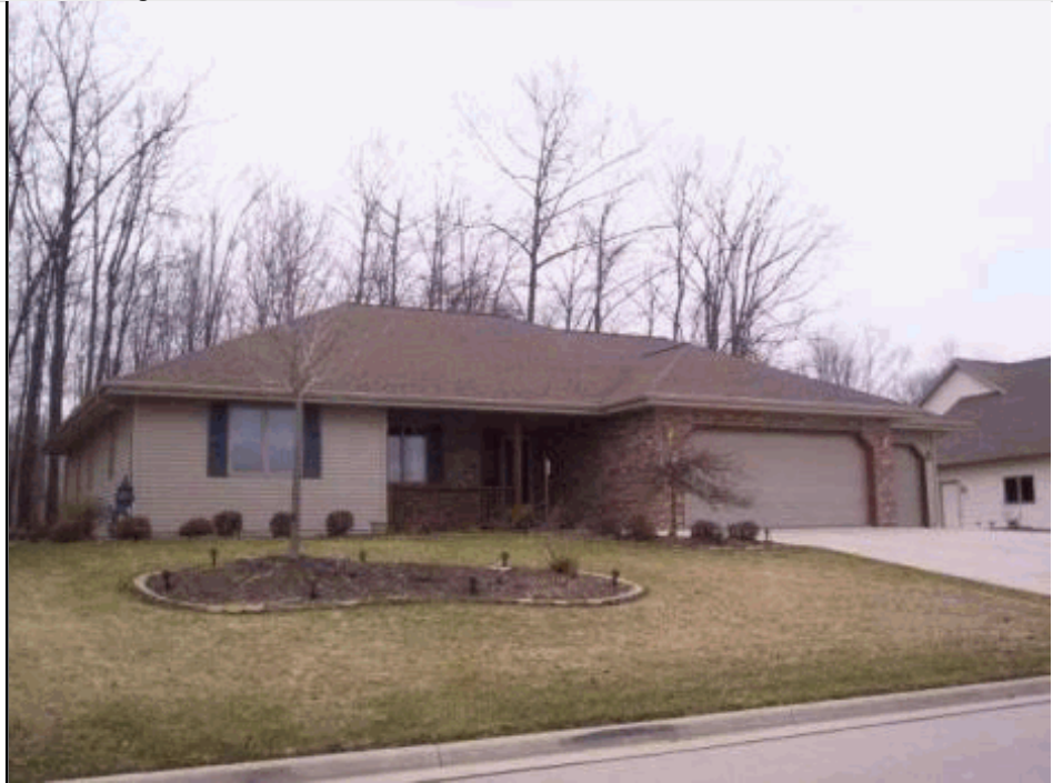
Total living area is 1,752 SF; building assessed value is $379,100