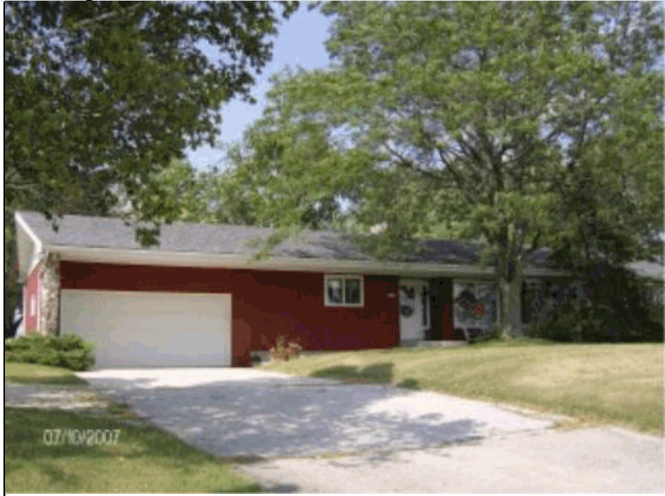
Total living area is 1,732 SF; building assessed value is $236,100