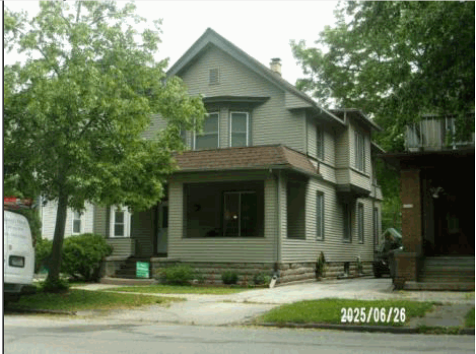
Total living area is 1,872 SF; building assessed value is $208,700