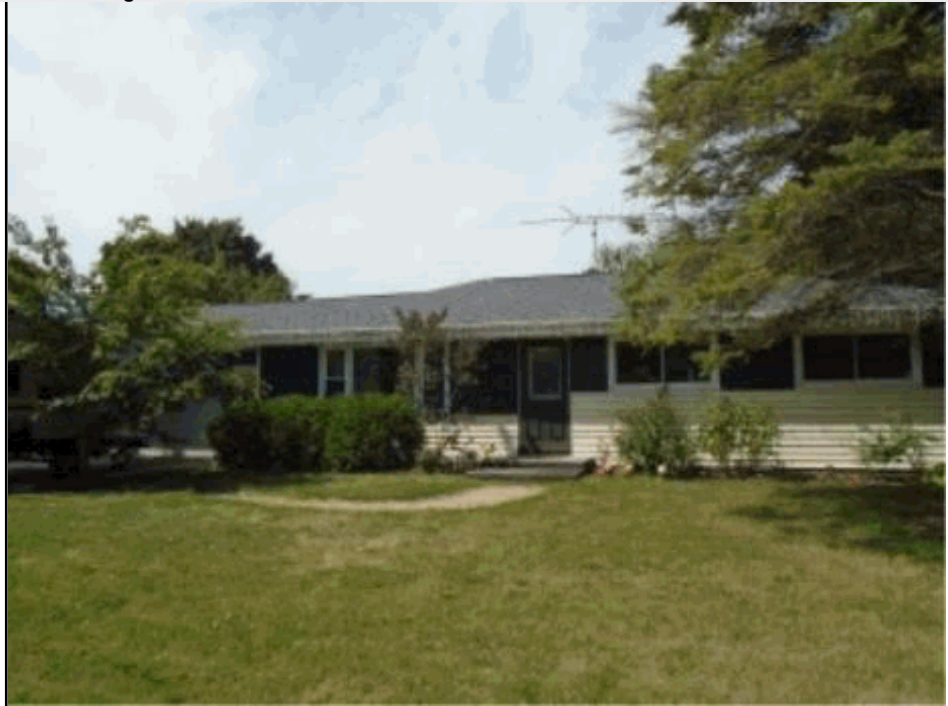
Total living area is 1,144 SF; building assessed value is $181,200