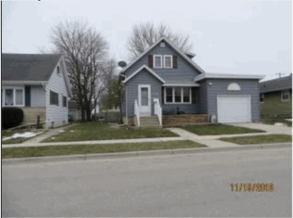
Total living area is 992 SF; building assessed value is $123,400