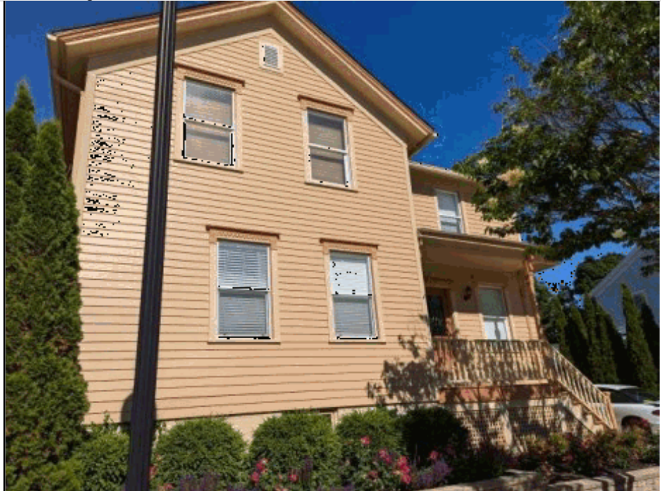
Total living area is 1,596 SF; building assessed value is $210,900