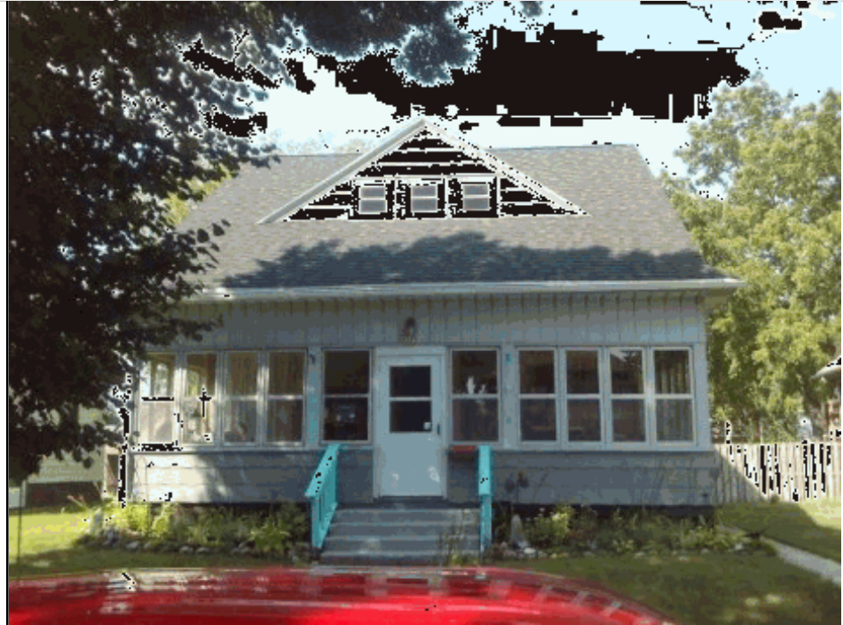
Total living area is 1,568 SF; building assessed value is $174,100