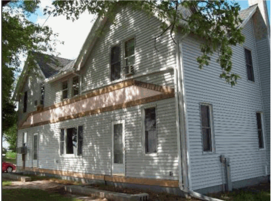
Total living area is 2,442 SF; building assessed value is $275,300