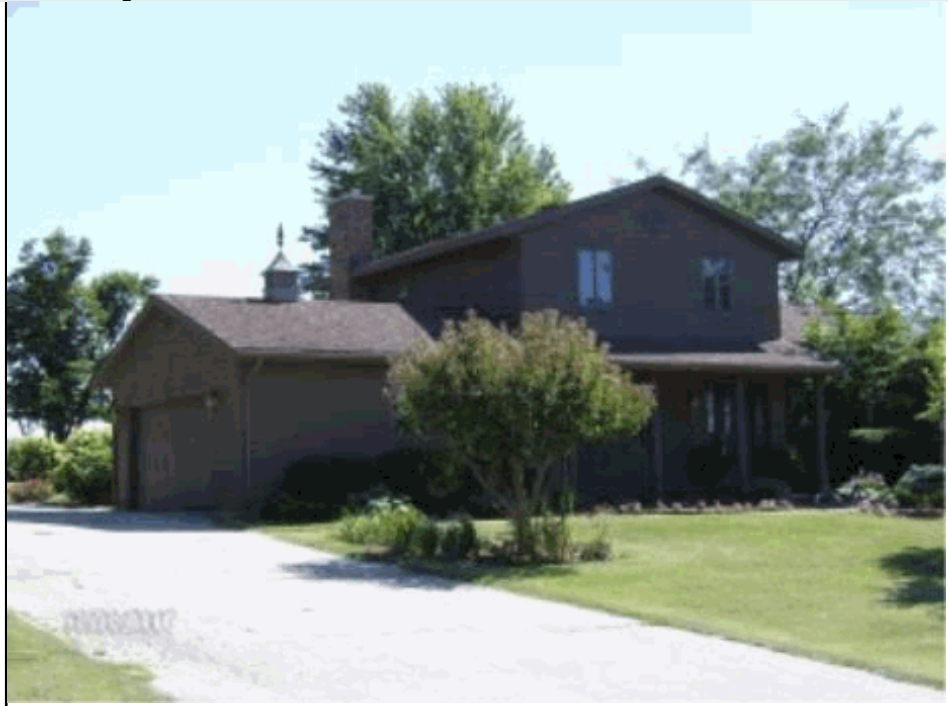
Total living area is 2,596 SF; building assessed value is $309,800